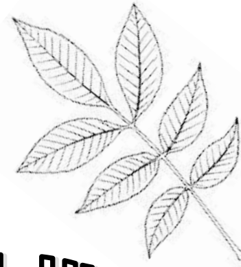
Shagbark Hickory Leaf